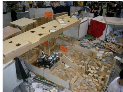
Figure 1: Top: Example of a Robocup RRL Standard arena, with the robot currently on a stepfield.

In this paper, we propose methods for characterising the environment in a way that makes behavioural cloning possible. We evaluate the pro-